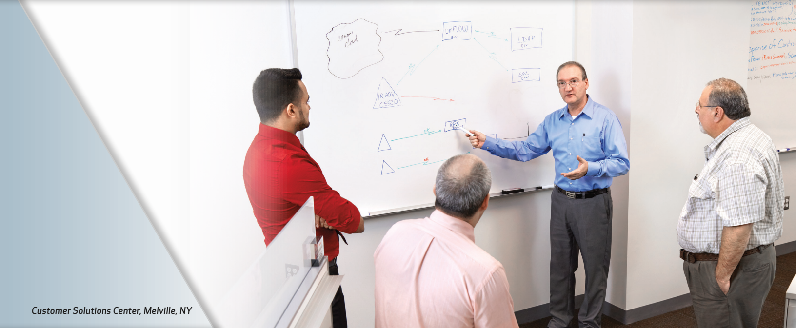
Customer Solutions Center, Melville, NY